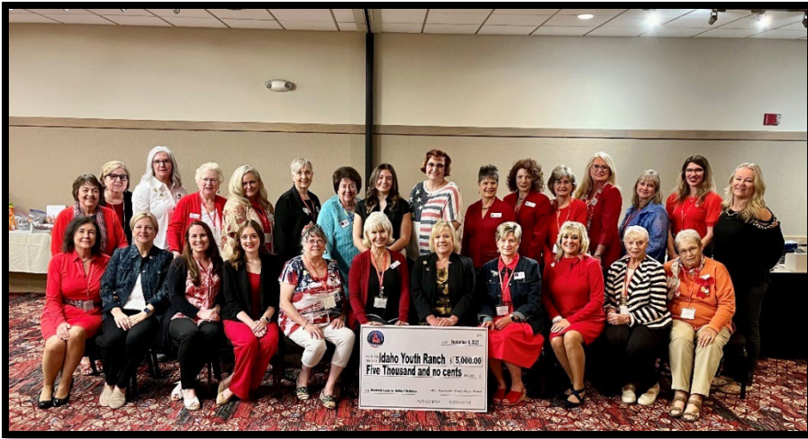
Caring for America 2023 Project Donation.